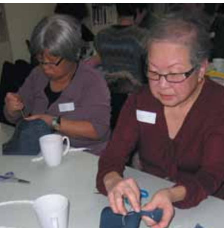
Women enjoy the relaxing art of Japanese embroidery, Sashiko