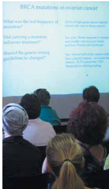
BreaCan and Ovarian Cancer Australia hosted an information session and afternoon tea as part of the Cancer Australia funded project

In 2011/2012 BreaCan expanded its capacity through increasing the volunteer workforce, securing funding to support specific project and capacity building initiatives, developing new productive partnerships and supporting student projects that directly relate to our strategic objectives. Our work with Ovarian Cancer Australia and some of our specific capacity building initiatives are highlighted here.