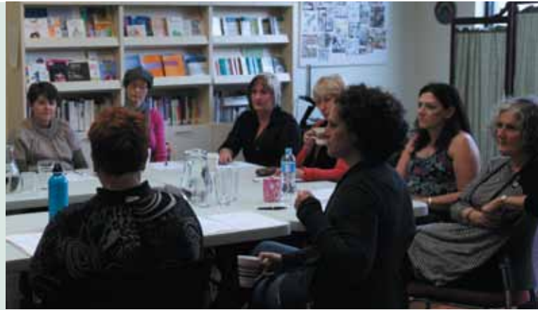
A meeting of the Volunteer Reference Group

BreaCan has successfully secured a one-off grant from the Cancer Strategy and Development Unit of the Victorian Department of Health that will provide some much needed capacity to increase our office space and infrastructure. This small increase in space will accommodate our growing team and provide a new multipurpose space that will support the provision of individual therapies such as: reflexology; small group sessions; meetings; and also provide a volunteer workspace separate from the Resource Centre. The grant will also improve our information and communications technology capability through enabling teleconferencing and videoconferencing to improve access for people who are not able to travel to the Resource Centre.