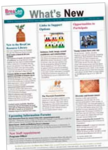
A copy of the What's New bulletin that can now be received in html email format