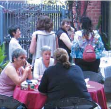
Women celebrate at the annual BreaCan end of year morning tea

BreaCan is at an exciting phase in its growth and development. With increasing demand for the service and consistent growth in a number of areas, there are many opportunities to further extend our reach and accessibility of the service for Victorian women, their partners, family members and friends. In 2012/2013, we will: