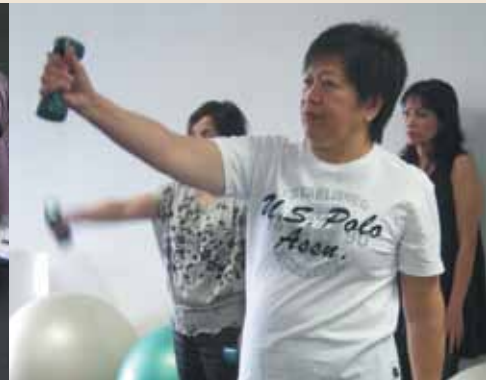
Participants in the five week 'Steps for Fun and Fitness' exercise program in Yarraville