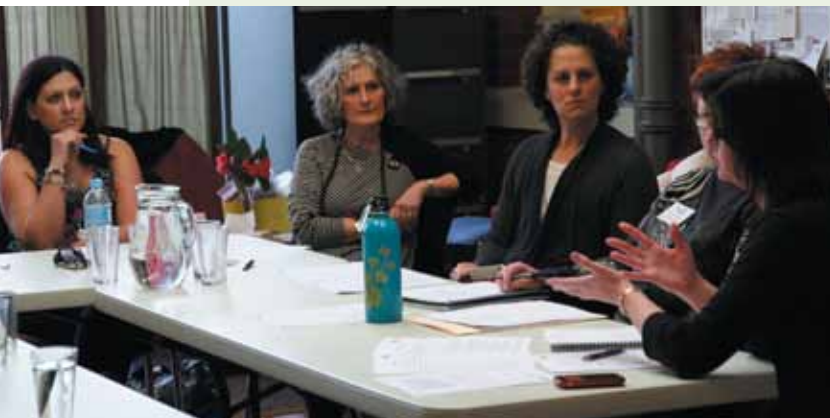
A meeting of the Breacan Volunteer Reference Group

* An individual may have attended more than one session