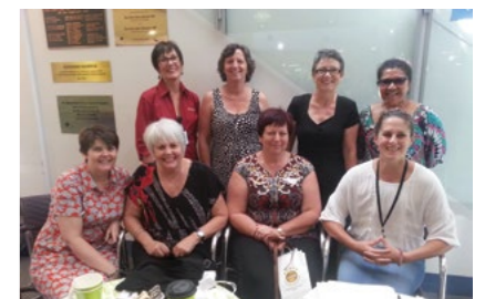
BreaCan volunteers at an orientation session at Sunshine Hospital, March 2016

The generosity of LUCRF Community Partnership Trust in funding the pilot project at Sunshine Hospital has been an invaluable opportunity to improve the wellbeing of women living in the west and diagnosed with breast cancer. With the ongoing commitment of our dedicated volunteers and the support of Western Health, we hope to see Bridge of Support continue at Sunshine Hospital.