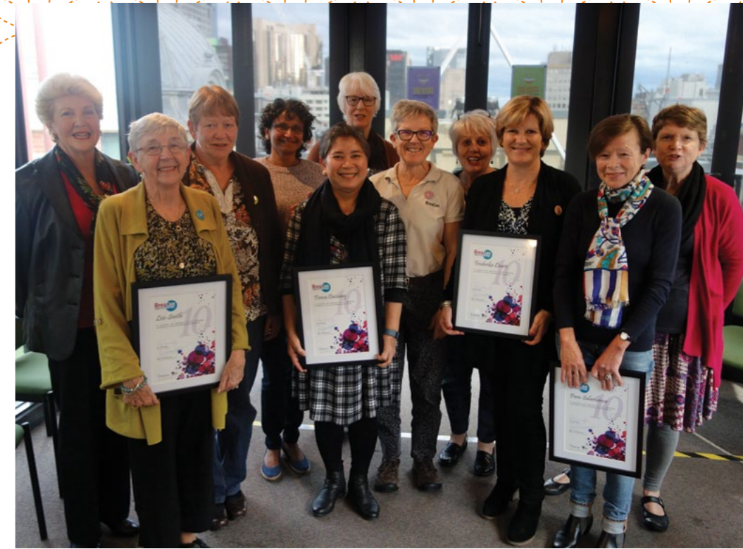
National Volunteer Week Celebration, May 2016

Our new Peer Support Volunteers, who bring a range of experiences to Breacan, are currently in the observation phase of their training where they are being mentored by experienced volunteers. They, along with our experienced Peer Support Volunteers, are providing practical and emotional support tailored to meet the specific needs of women who access our service.