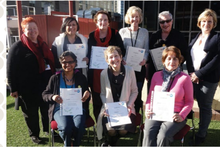
2016 Peer Support Volunteer intake