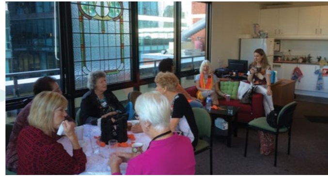
Harmony Day morning tea in the new BreaCan Resource Centre on Level 5, QVWC, March 2016

As always, we are thankful to the presenters who have contributed such a high calibre of information, discussion and insight to our What's On program. We also depend on the wonderful support and commitment of those health professionals who promote our information sessions to relevant women.